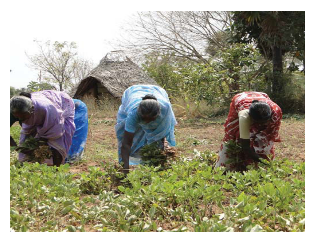
Members harvesting groundnut crop from a collective farm