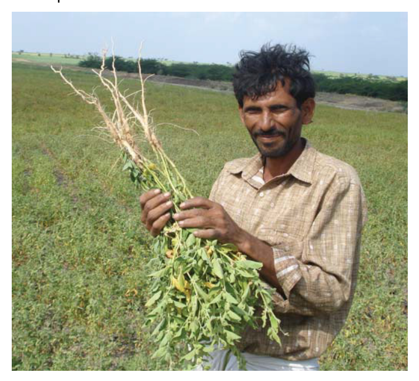
AFF member showing Ashwagandha plants

The members of the group are supported with a financial assistance from the Department of Horticulture under National Medicinal Plants Mission.