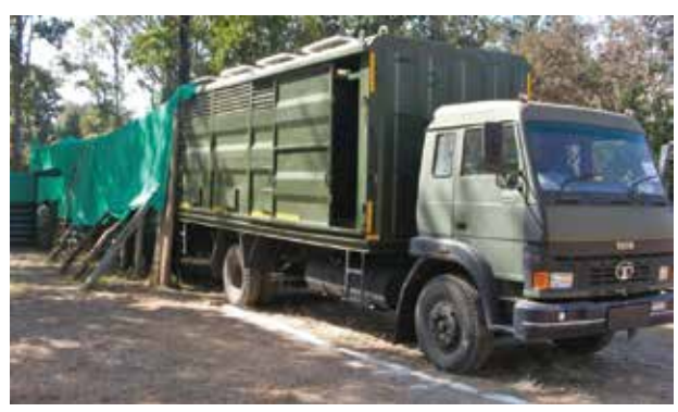
Photo 15: Specially designed vehicle for transportation of gaur, at Kanha Tiger Reserve