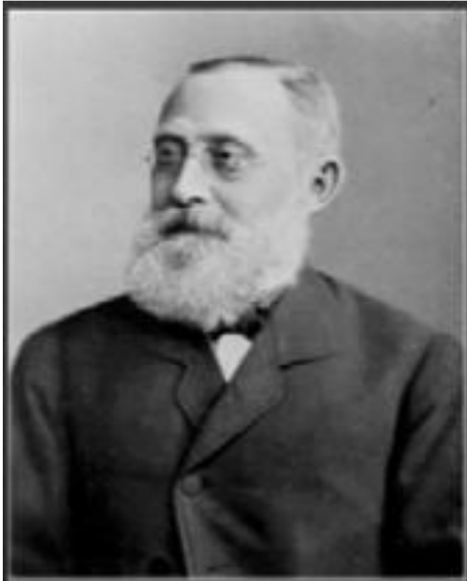
Rudolf Virchow 1821-1905