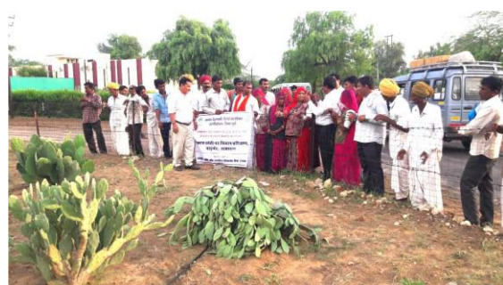
Farmers training cum exposure to BAIFs Desert Research Center, Undkha, Barmer