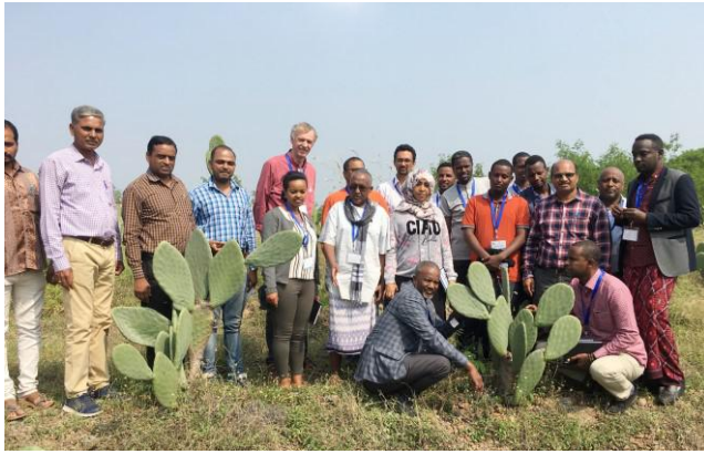
Visit of International delegation to Urulikanchan