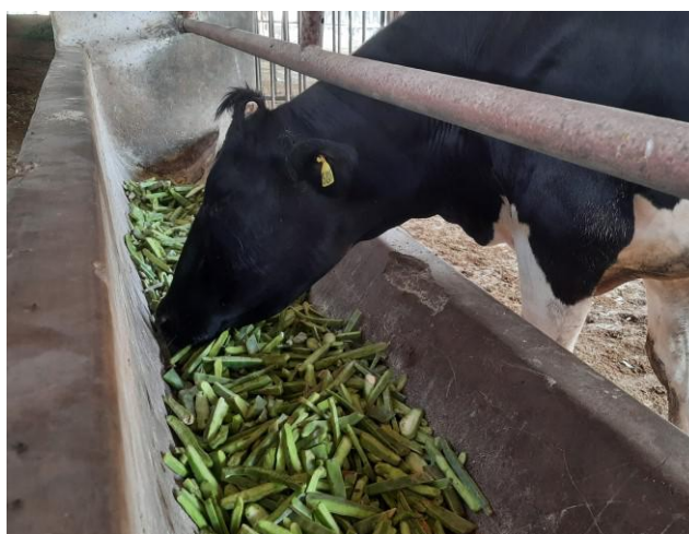
Cactus feeding trial in milking cows at BAIF, Urulikanchan