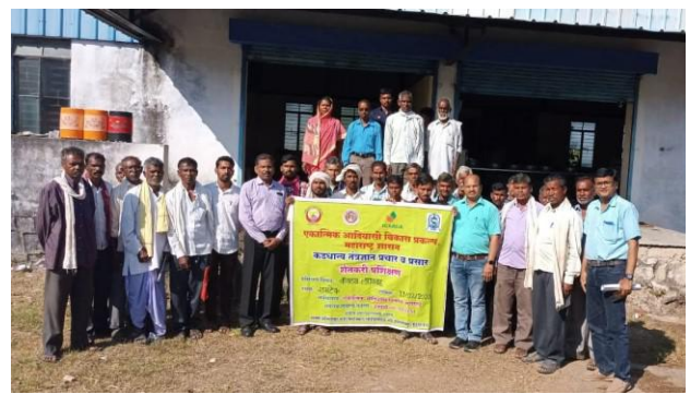
Farmers training conducted on cactus cultivation under ICARDA project at Nagpur