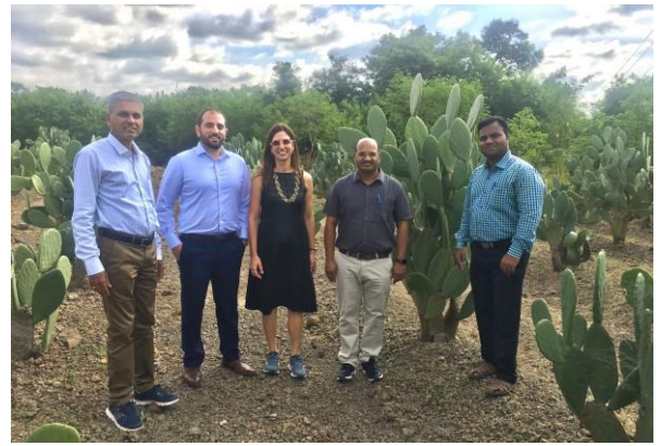
Visit of Start-up Nation Central delegates, Israel to Urulikanchan