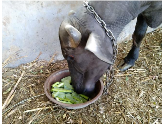
Cactus feeding to buffalo at farmer's field in Raper, Bhuj

Results: The results of the experiment indicated that buffaloes in experimental group fed with cactus gained higher total body weight of 5.83 kg and average daily gain in body weight of 95.57 g/day over the control group where the values were 3.00 kg and 49.18 g/day. It was also found that the water intake by buffaloes fed Cactus was reduced by 35 %. The milk yield was not influenced in both control and experimental groups.