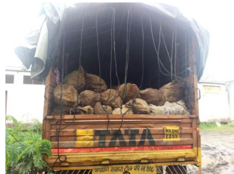
Dispatch of planting material for establishment of demonstrations at farmer's field