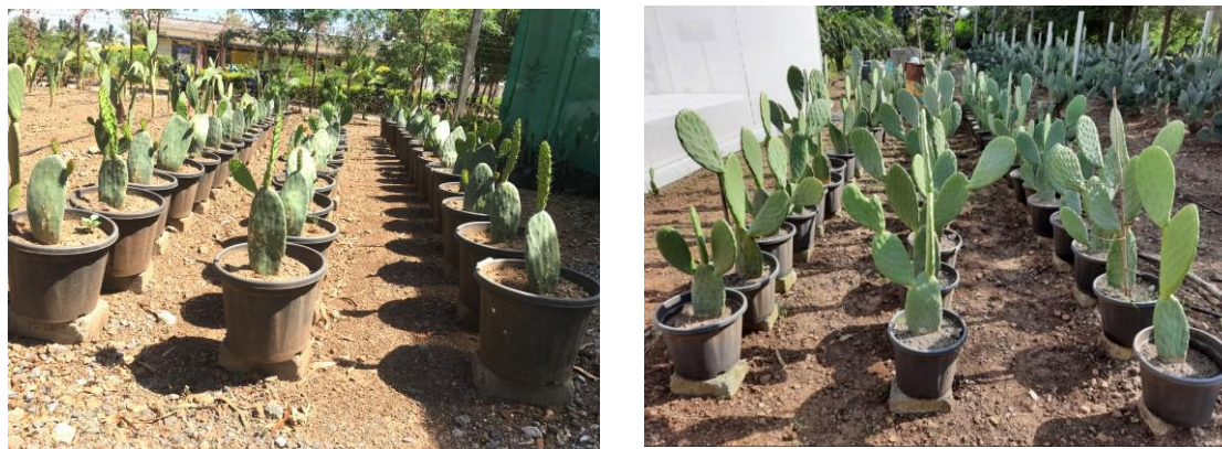
Pot trial experiment on Water Use Efficiency in Cactus at Urulikanchan

The water-use efficiency value for 1 year old Opuntia ficus indica was obtained by measuring the relative growth rate / amount of water lost from soil due to evapotranspiration over a period of one month in a pot culture experiment. Above-ground fresh and dry matter production was obtained by complete harvest of the plants. Evapotranspiration was estimated as the change in soil water content and plant water content, as applicable to succulents (Han and Felker, 1997). The water content at field capacity (WFC) was measured using a pot in which no plant was grown (Table 10).