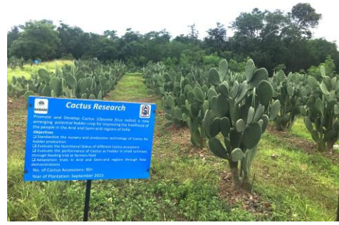
Cactus arboretum at BAIF, Urulikanchan