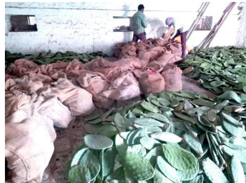
Preparation of cactus planting material for supply to Gujarat and Rajasthan