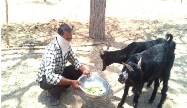
Cactus feeding in goats on farmer's field at Barmer