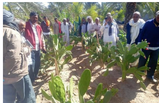
Farmers training cum exposure visit to CAZRI-RRS, Kukma, Bhuj