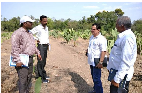
Orientation training of project staff on cactus cultivation at BAIF, Urulikanchan