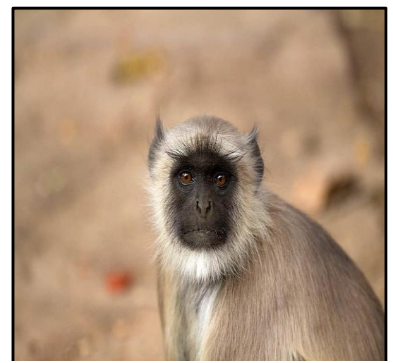
Grey langur or Hanuman langur Semnopithecus sp. (Predator)

Monkey menace in Jammu Division: The effect of monkey problem in terms of area, farming families, villages and per cent losses is as under: