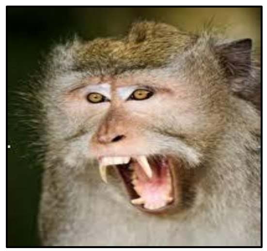
Rhesus macaque/Macaca malatta (Pest)