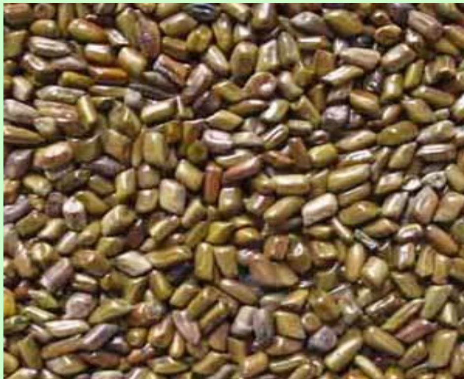
Kumadia seed ( cassia tora linn)