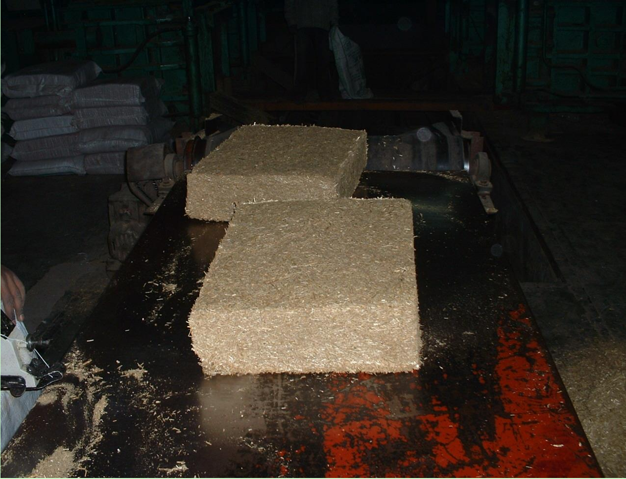
Complete feed block