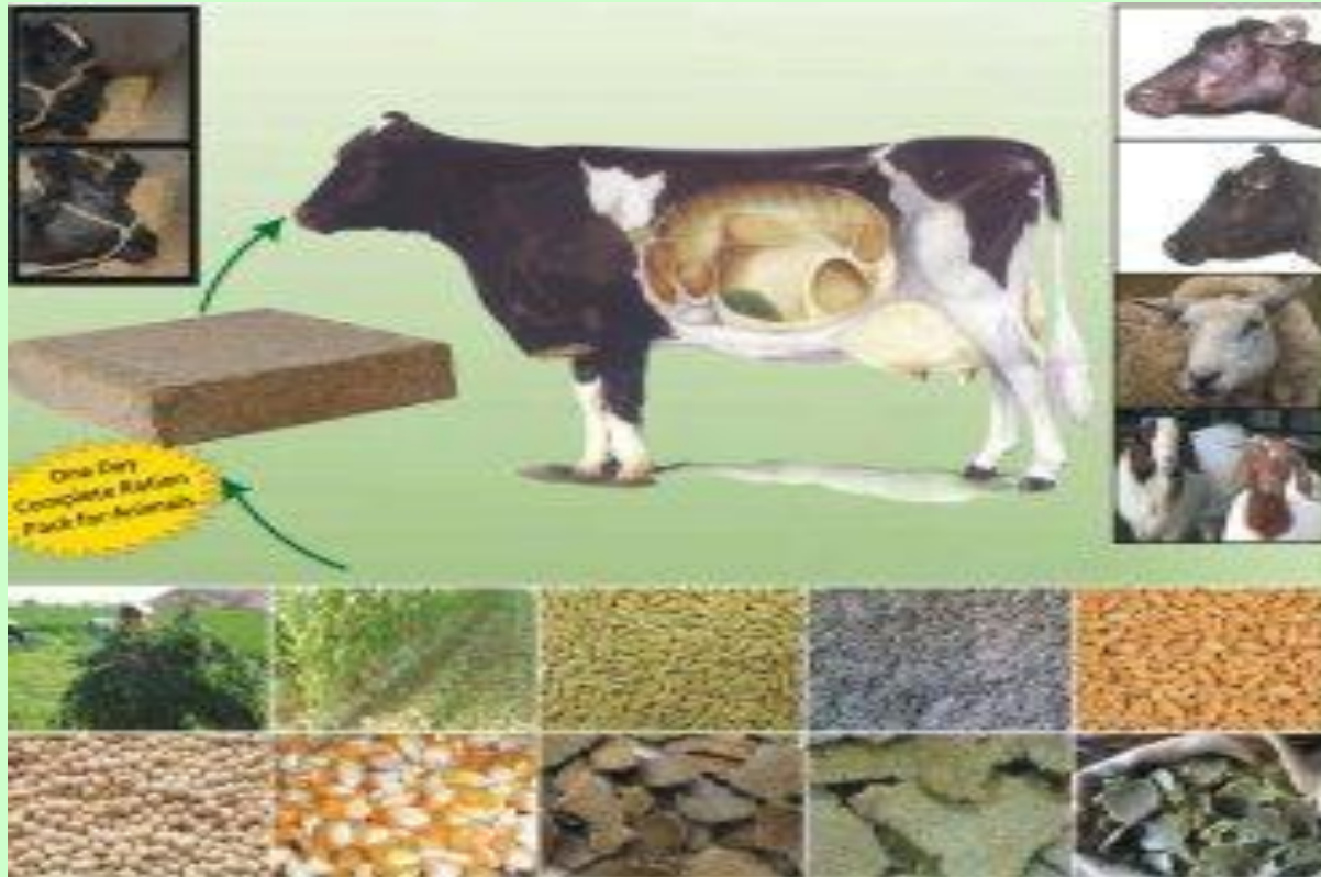
Complete feed block