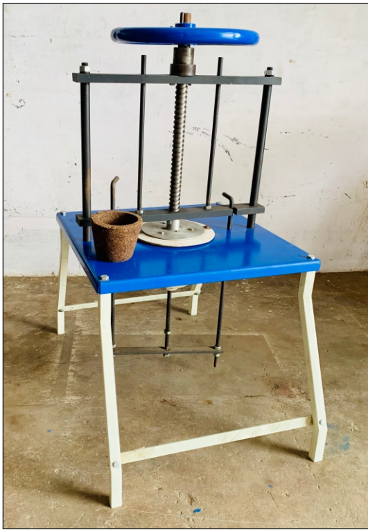
Cow Dung Pot Making Machine