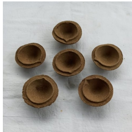
Cow Dung Dia