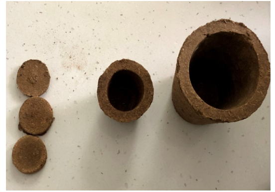
Cow dung Pot and Round Cake