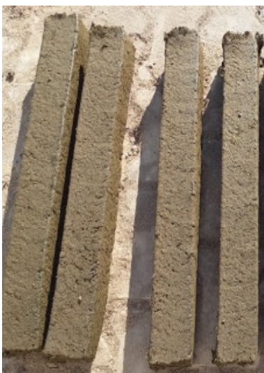
Cow Dung Log