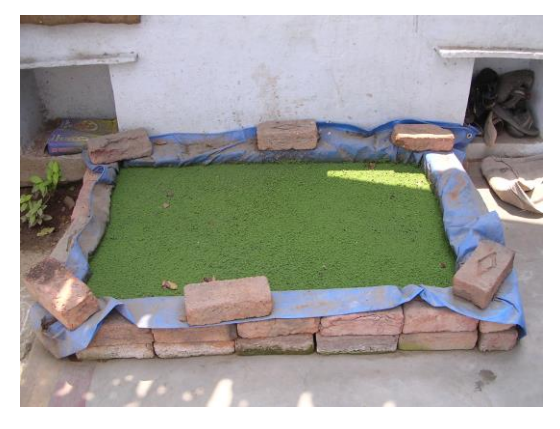
Pic.2 Azolla fodder plot in courtyard.