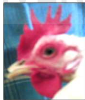
Fig 11.3: Trimmed beak