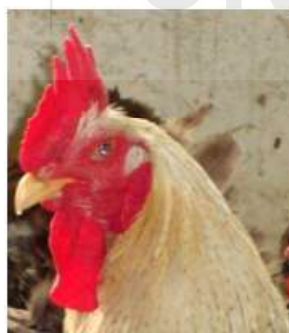
Fig 11.2: Normal beak