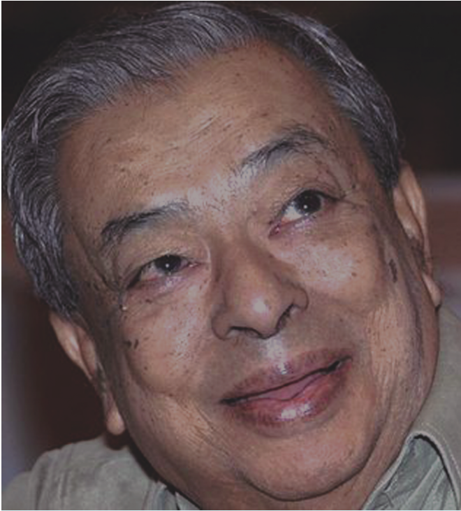
Dr. Verghese Kurien